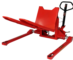
The straddle Logitilt can handle many different pallet types, also closed pallets.