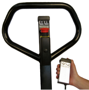
Remote control for the tilt function.