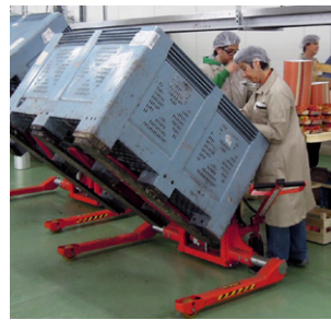
The handle can be turned to the side, so that the user has free access to the contents of the crate or box.