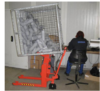
Perfect working position when emptying boxes and crates - sitting as well as standing.